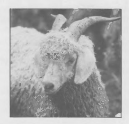
Angora goats help minimize seed production of leafy spurge through grazing.

many variables – weather, summer forage conditions, availability of thermal cover, etc., – so the impacts of weeds on productivity could be minor. However, since