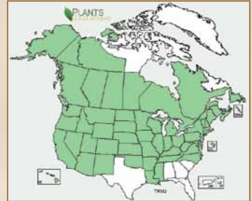
FIGURE 1. OCCURRENCE OF COMMON TANSY IN THE UNITED STATES AND CANADA ( HTTP://PLANTS.USDA.GOV )