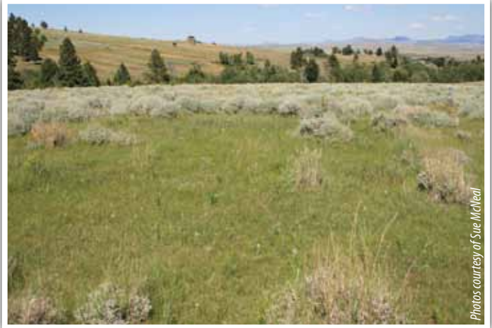
Photos showing impact of Aphthona flea beetles on leafy spurge over time at the Steinbach Ranch, Rocky Mountain Front: July 2004 (LEFT) and July 2011 (RIGHT).

has been receiving insects from McNeal each year since 2003 and is a strong supporter of the biological control effort. “We had over 100 acres of leafy spurge and we couldn’t stop the weed from spreading,” says Steinbach. “We’ve released thousands of flea beetles on our leafy spurge infestation the last nine years.” Today the insects are controlling the largest infestation, and Steinbach concentrates herbicide applications on newly invading patches of leafy spurge and on sites where the insect does not establish. “We feel confident that we have a good strategy in place to contain and control leafy spurge on our ranch,” says Steinbach.