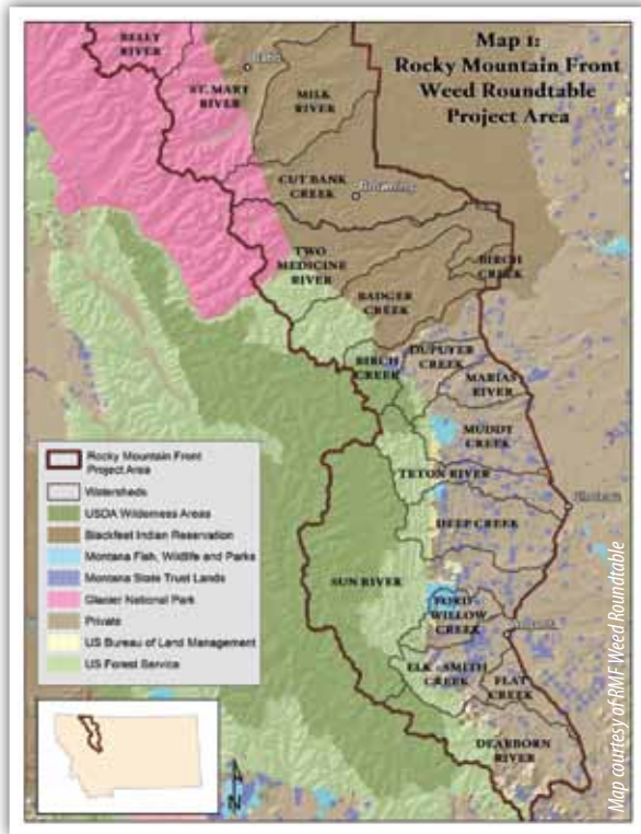
Figure 1. The Rocky Mountain Front Weed Roundtable project area encompasses about three million acres from the South Fork of the Dearborn River to the Canadian border.