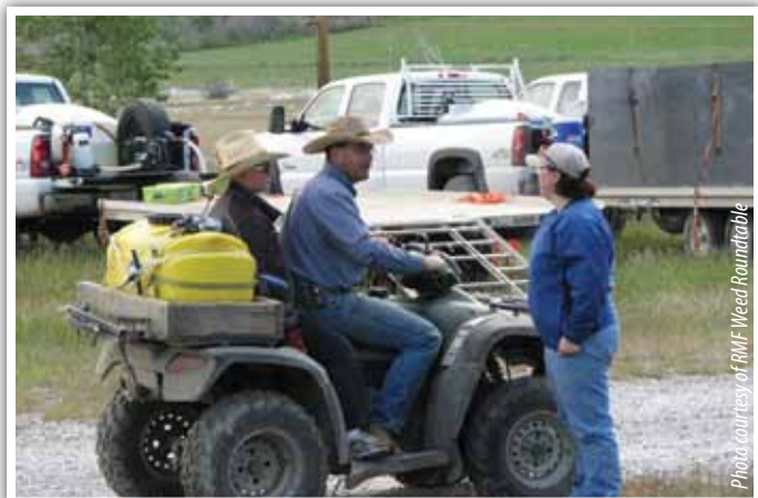
Volunteers check in during Swift Dam Spray Day on Birch Creek in Pondera County.

CONSERVING BOTH PUBLIC AND PRIVATE LANDS IS CRITICAL TO MAINTAINING THE CHARACTER OF THE ROCKY MOUNTAIN FRONT.